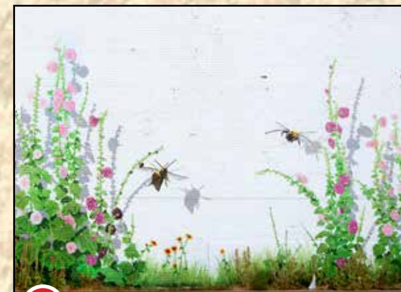
7 ARTIST: Travis Rhett Ivey TITLE: Hollyhock Haven , 2011 LOCATION: City of Laramie Parking Lot, Custer St. between First and Second St.