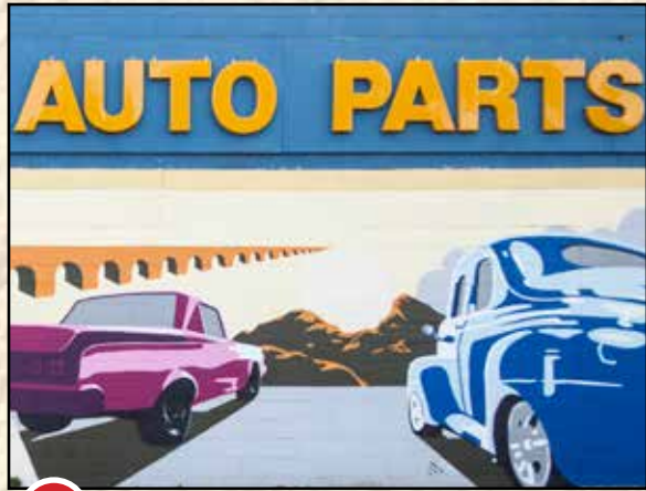
11 ARTIST: Talal Cockar TITLE: We Built the Dream , 2014 LOCATION: 606 S. 2nd Street