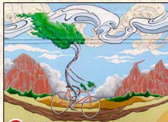
6 ARTIST: Meghan Meier TITLE: Escape , 2012 LOCATION: Undercover Beds and Spas, Second and Garfield St.