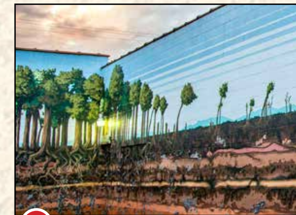
9 ARTIST: Dan Toro TITLE: Growth , 2012 LOCATION: Source Gas, 416 S. Third St.