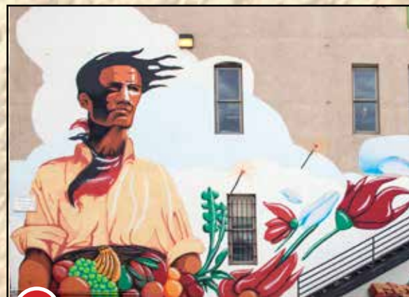
3 ARTIST: Talal Cockar TITLE: Tierra y Libertad , 2011 LOCATION: Big Hollow Food Co-Op, 119 S. First St.

Dial 307-200-0040 then hit the number below, followed by the pound sign (#) to hear the mural artists talk about their work.